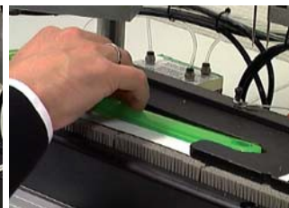
2. Insert product