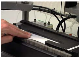
1. Insert card