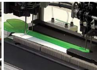
3. Fastening sequence