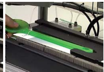
4. Remove product